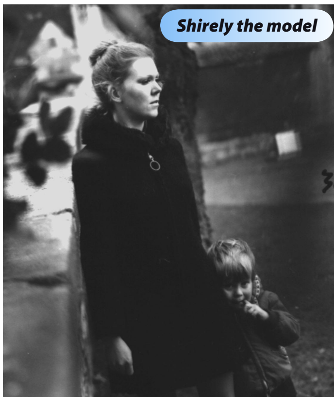
Shirely the model

Anything else: Yes, any tips for getting husbands to be tidy? Answers on a £10.